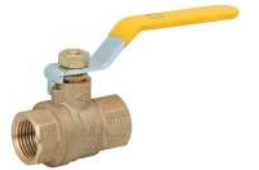
Female Water Supply 1/2" Threaded Ball Valve

If the system is to be installed in an enclosed space, adequate ventilation must be provided. For Indoor Use Only