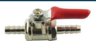
CO2 Supply 1/4" Barbed Shutoff